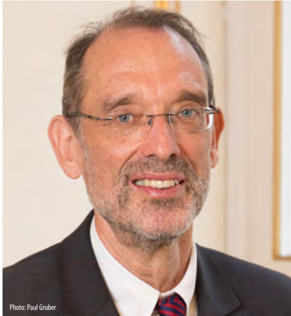
Federal Minister of Education, Science and Research Univ.-Prof. Dr. Heinz Faßmann