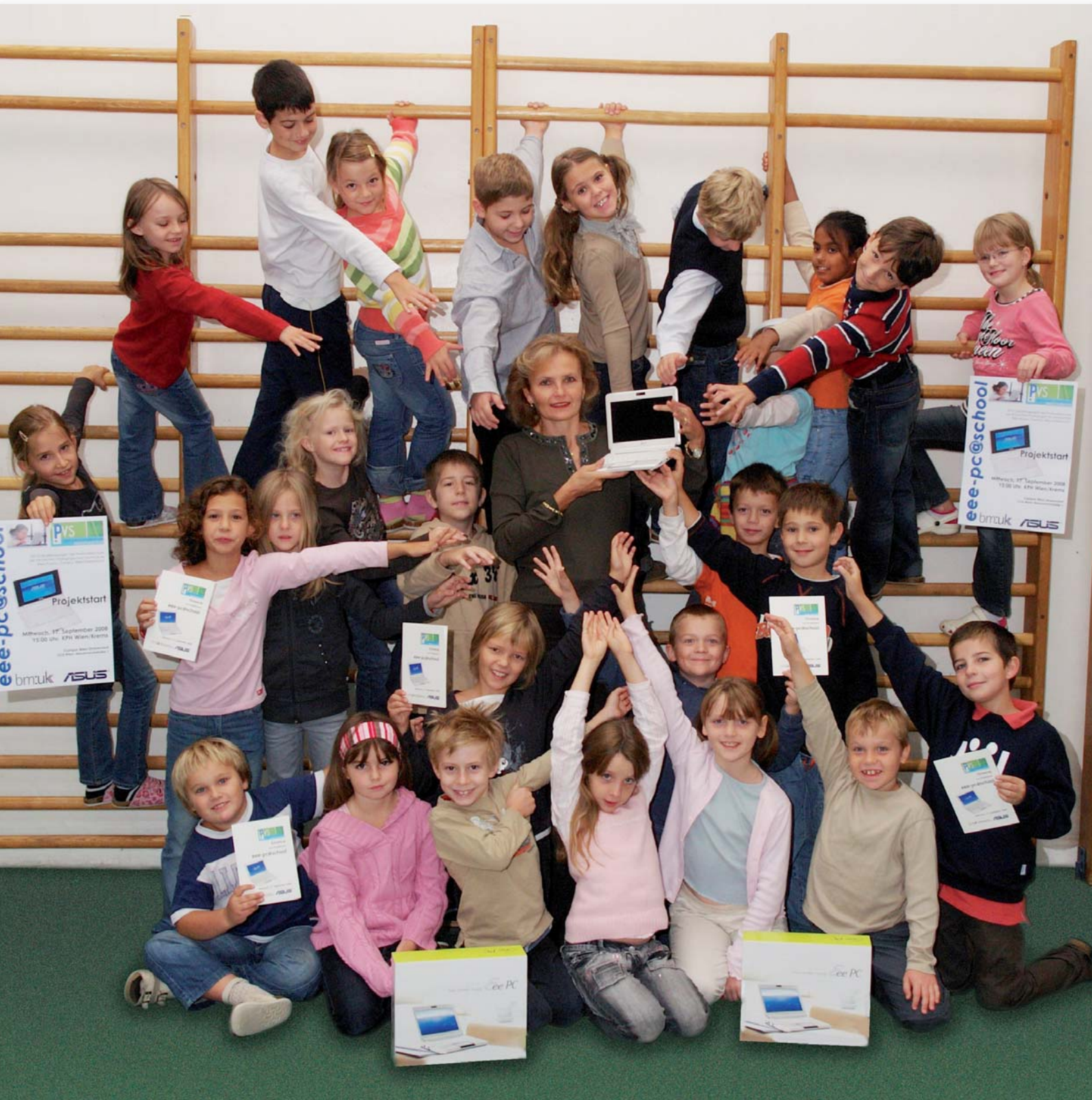
Project class 3a